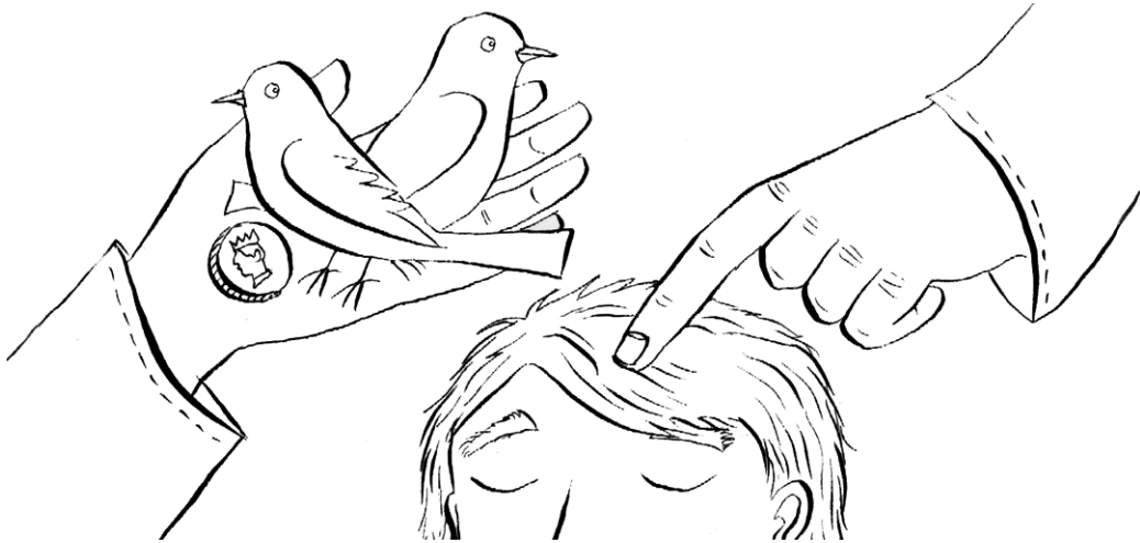
Even the hairs on your head are counted.

Jesus reminds us that we need to stand up and speak out for our faith, even when it is costly to us.