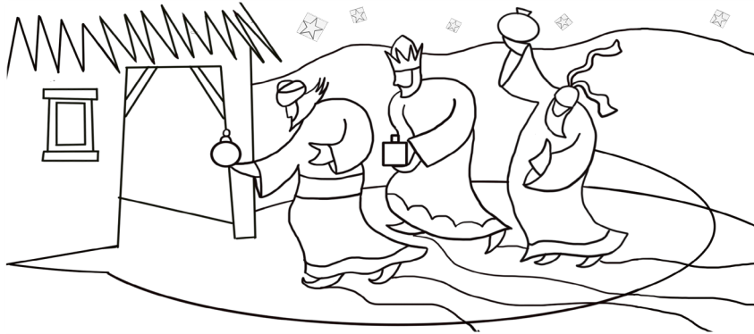
Jesus' birth brings hope in the darkness.

Wise men journey to give special gifts to the baby Jesus; they have hope that he will be a special king for the world.