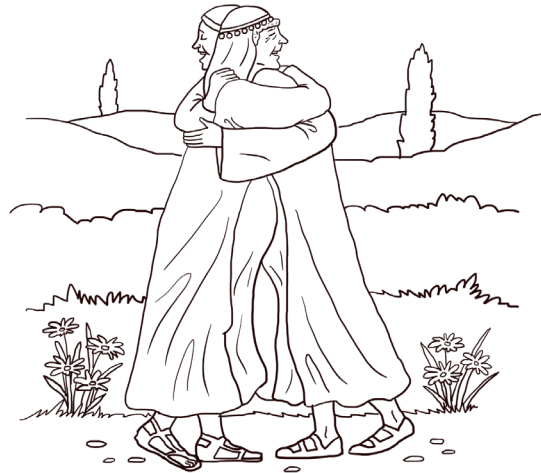
Elizabeth and Mary greet each other.

As Mary and Elizabeth greet each other Elizabeth talks of the blessings that Mary has received.