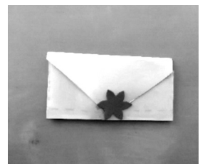
Turn it round and seal with a sticker