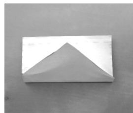
Fold up the bottom